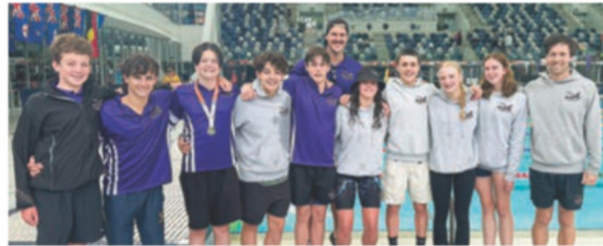
A large group of teammates supported each other through the finals.