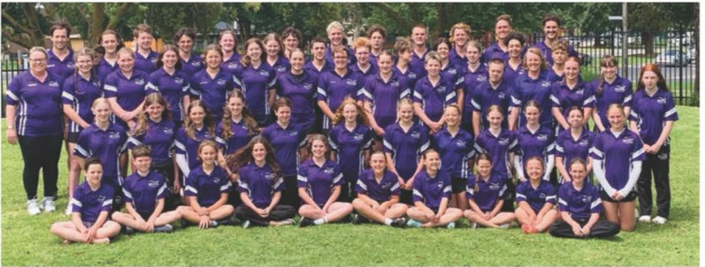
The South Gippsland Bass 2024 team achieved excellent results in the Victorian Country Championships at Traralgon.