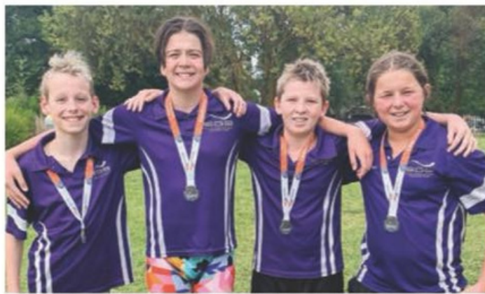
The U12 boys achieved second place in the freestyle and medley relays.