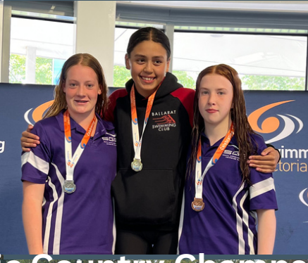
Vic Country Champs